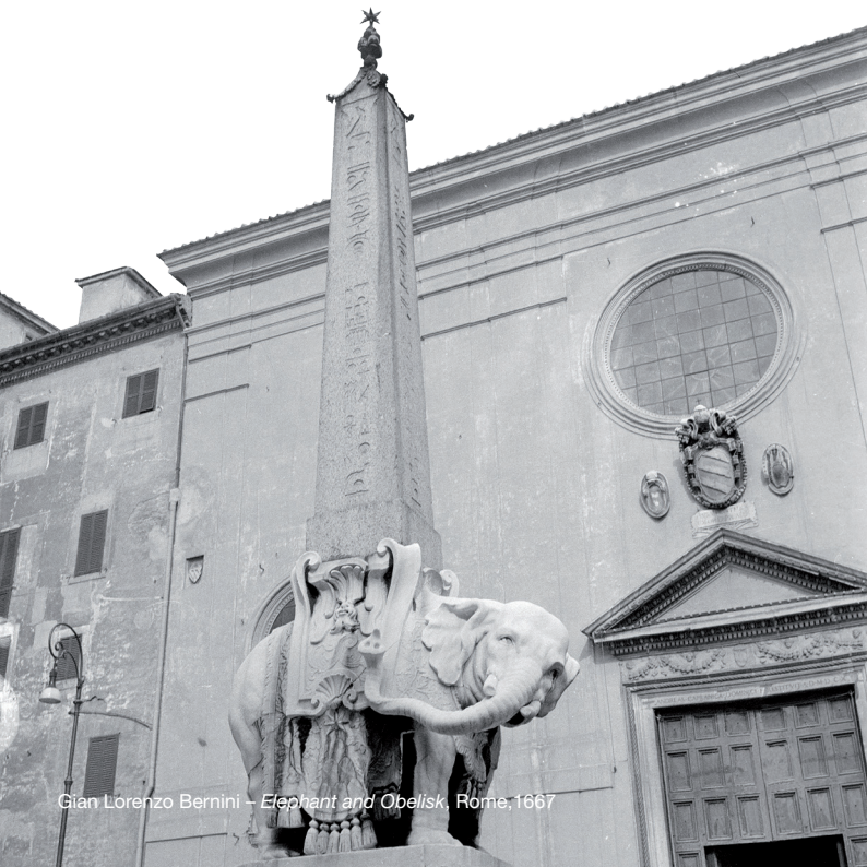
Gian Lorenzo Bernini – Elephant and Obelisk , Rome, 1667