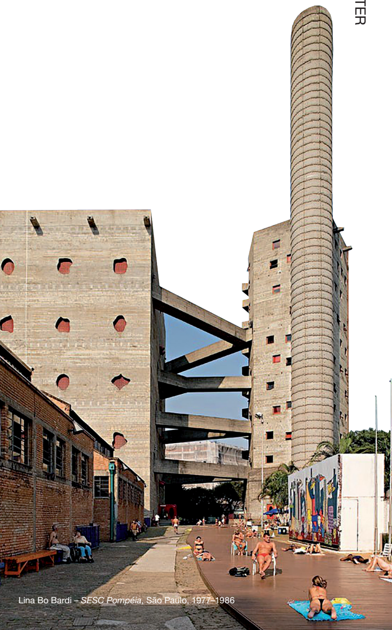
Lina Bo Bardi – SESC Pompéia, São Paulo, 1977–1986